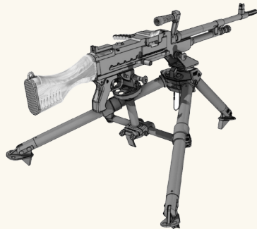
Light-Weight Tripod with Solid Mount Yoke.