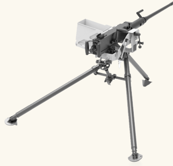
Tripod with 40/50 Soft Mount.