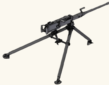
Heavy-Weight Tripod with M2 Yoke.