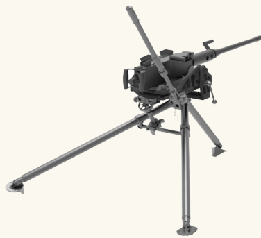
Tripod with Soft Mount and Shoulder Bar.

Modular Design (efficient ILS, servicing, repair & redeploy).