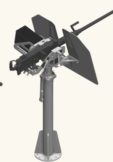
Pedestal with Shield.