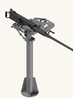
Pedestal with 40/50 Soft Mount.

Mass: ~65kg (excluding the weapon and ammo).