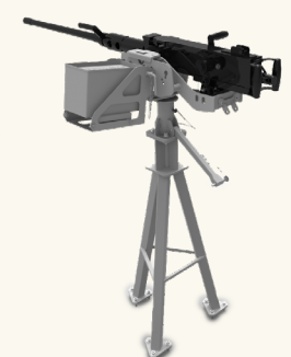
Tripod Pedestal with 40/50 Soft Mount.