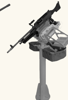
Pedestal with Soft Mount/Catch Bag.