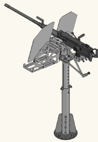
Adjustable Pedestal with 40/50 Soft Mount and Shield.